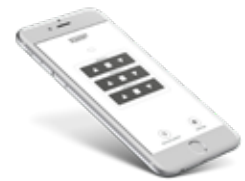
Fresh Air Control - app