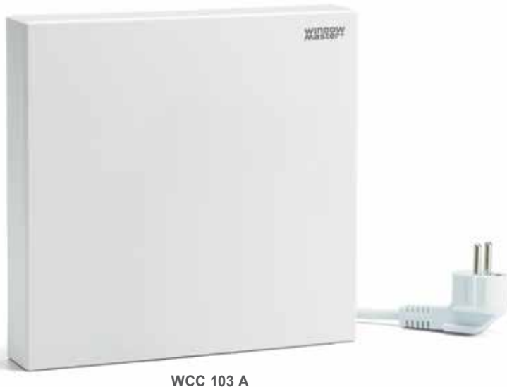
WCC 103 A