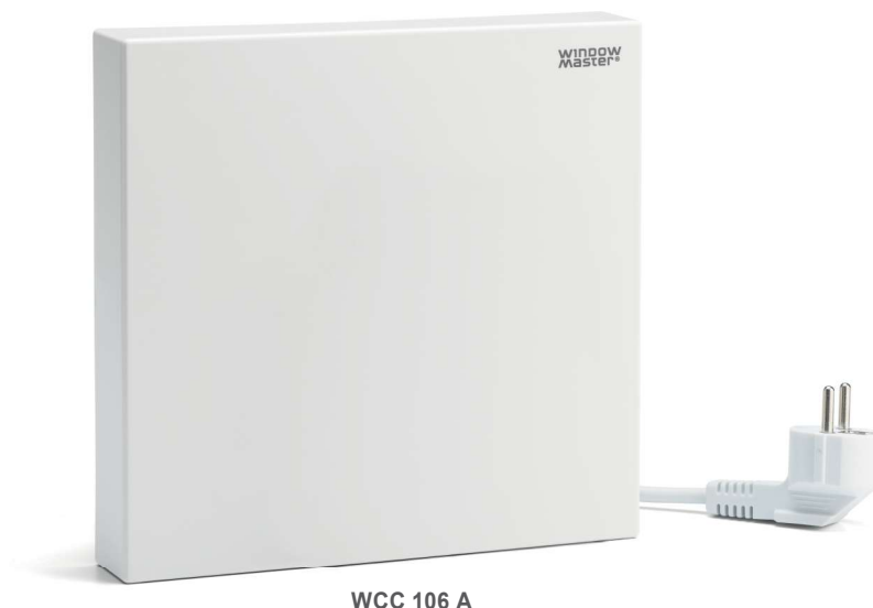
WCC 106 A