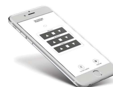
Fresh Air Control - app