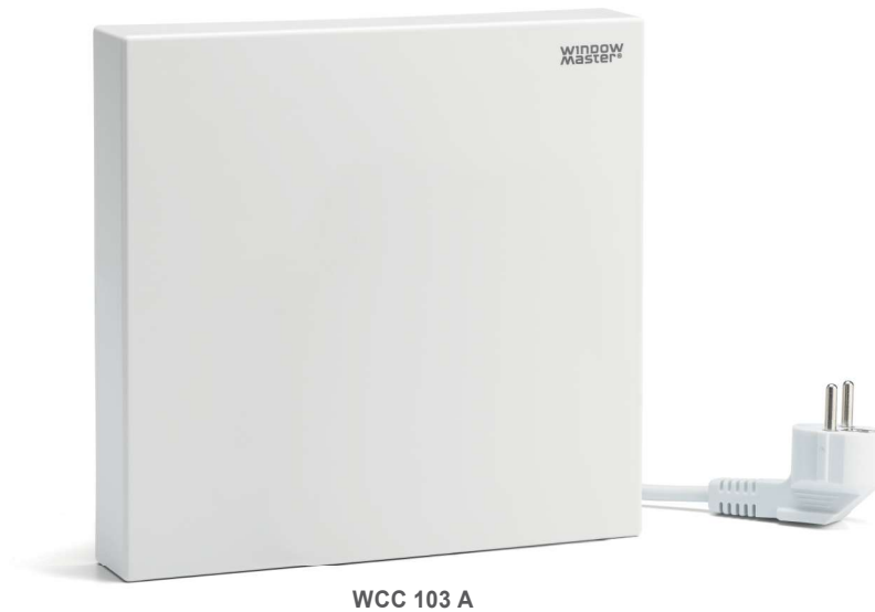
WCC 103 A