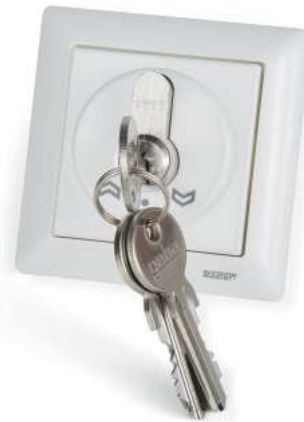
WSA 210 1161